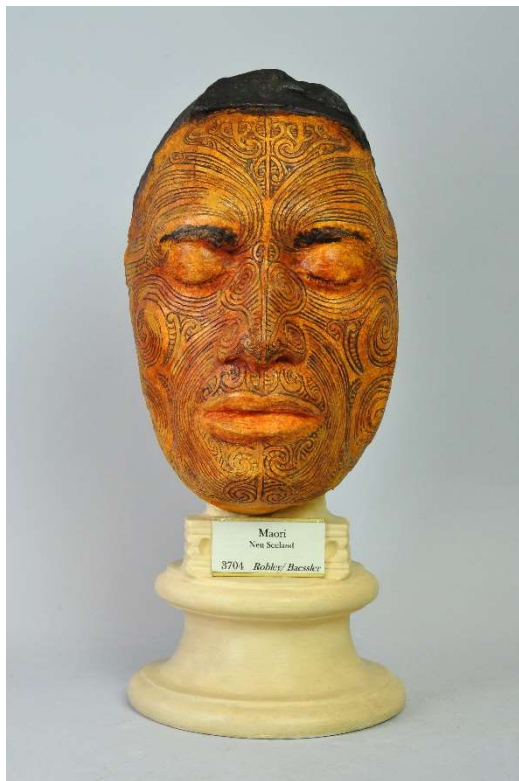
Figure 2 Grassi Museum copy of Tapua Te Whanoa's life mask