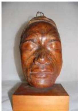
Figure 4 British Museum copy of Te Whanoa's life mask Oc1854,1229.93

The mask came to the British Museum as part of George Grey's extensive collections. The 'copies' were circulated by Horatio Robley, the notorious dealer and trader of Māori human remains and artefacts. Taupua Te Whanoa, was the son of Te Whanoa and descendant of Pukaki of Ngati Whakaue [information supplied by Paul Tapsell, 1996].