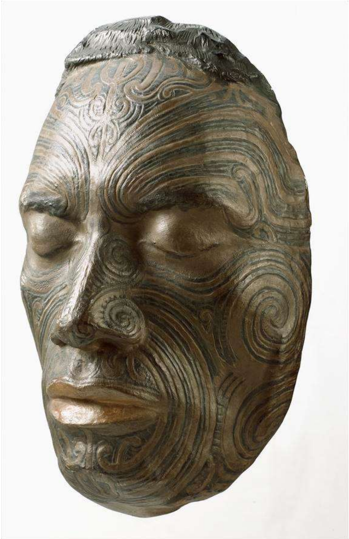
Figure 5 Wellcome Science Museum copy of Tapua Te Whanoa's life cast