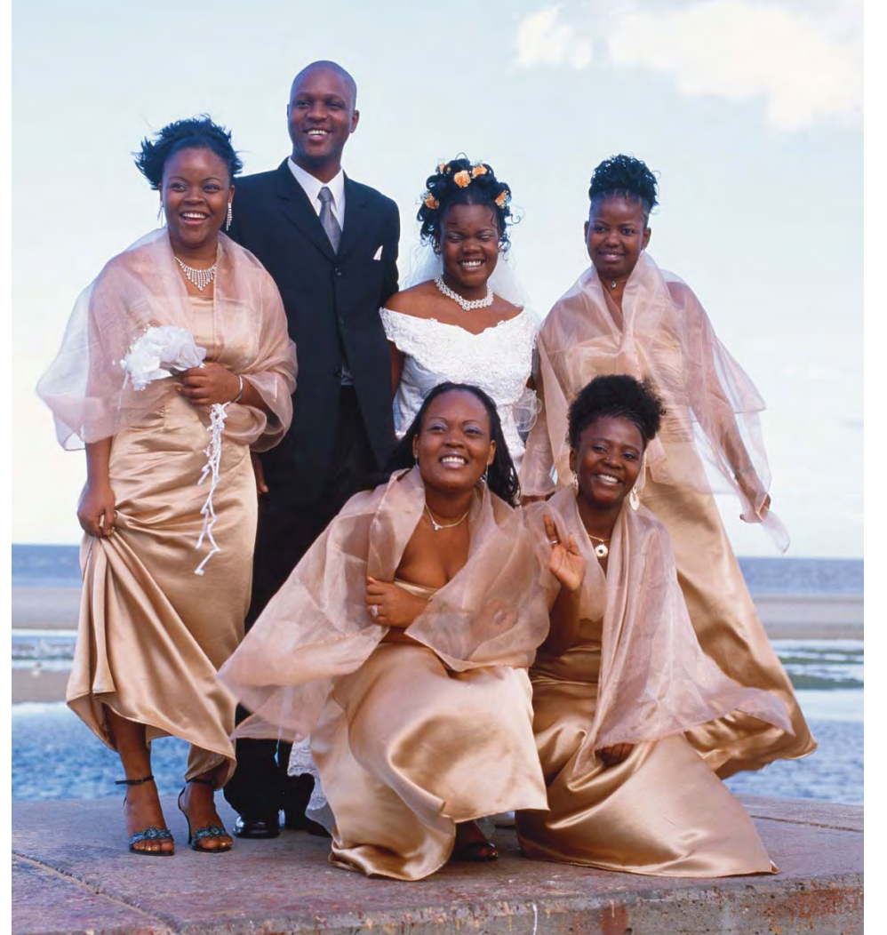
10 African wedding in Costa do Sol, Maputo, Mozambique, 2004. The spread of Christianity has encouraged many African brides to wear white wedding dresses.