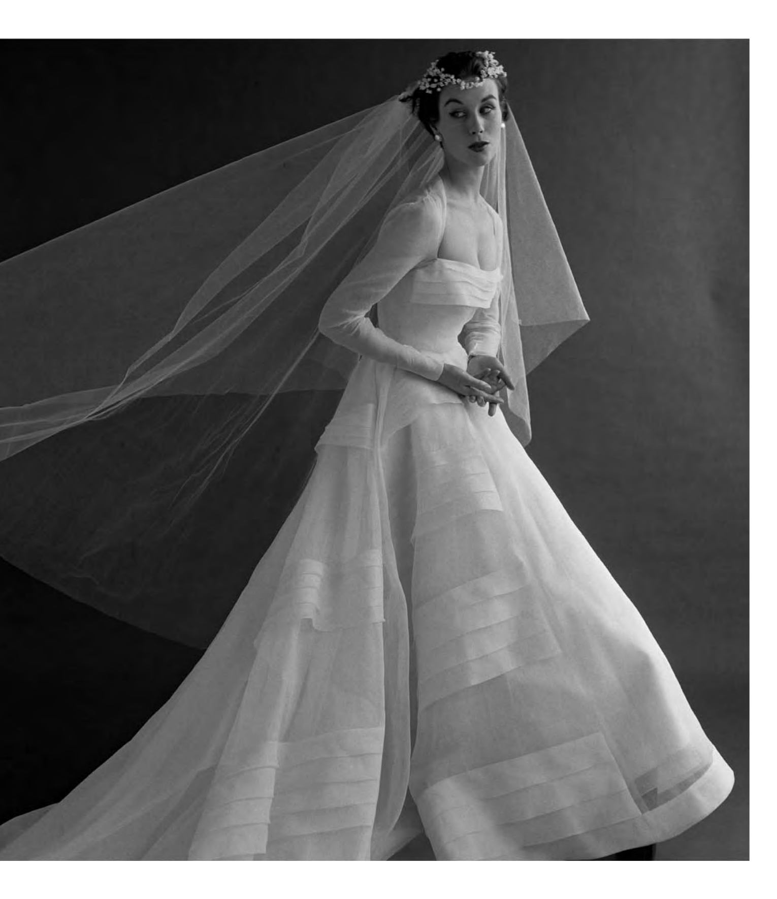
111 Cotton organdie wedding dress designed by Hardy Amies for the Cotton Board, 1953.

Britain was well-known for its high-quality ready-to-wear companies which employed welltrained in-house designers and copied models purchased from couture houses in Paris and London. Ready-to-wear wedding outfits were available from department stores, the salons of bridal wear companies and bridal boutiques, all of which offered specialist advice, fitters and an alteration service. Some sold models that could be made to the client's measurements alongside off-the-peg styles. Bridal wear companies included Mercia – at the top end of the market, with a salon in Cavendish Place in central London and sold through 'exclusive' outlets throughout the country - and Roecliff & Chapman, who offered more accessibly priced dresses made from man-made fibres. Versatility remained important as Britain inched towards economic recovery and most wedding dresses were evening styles which could be worn afterwards, sold with a matching bolero or jacket to cover the décolletage and arms during the wedding ceremony.