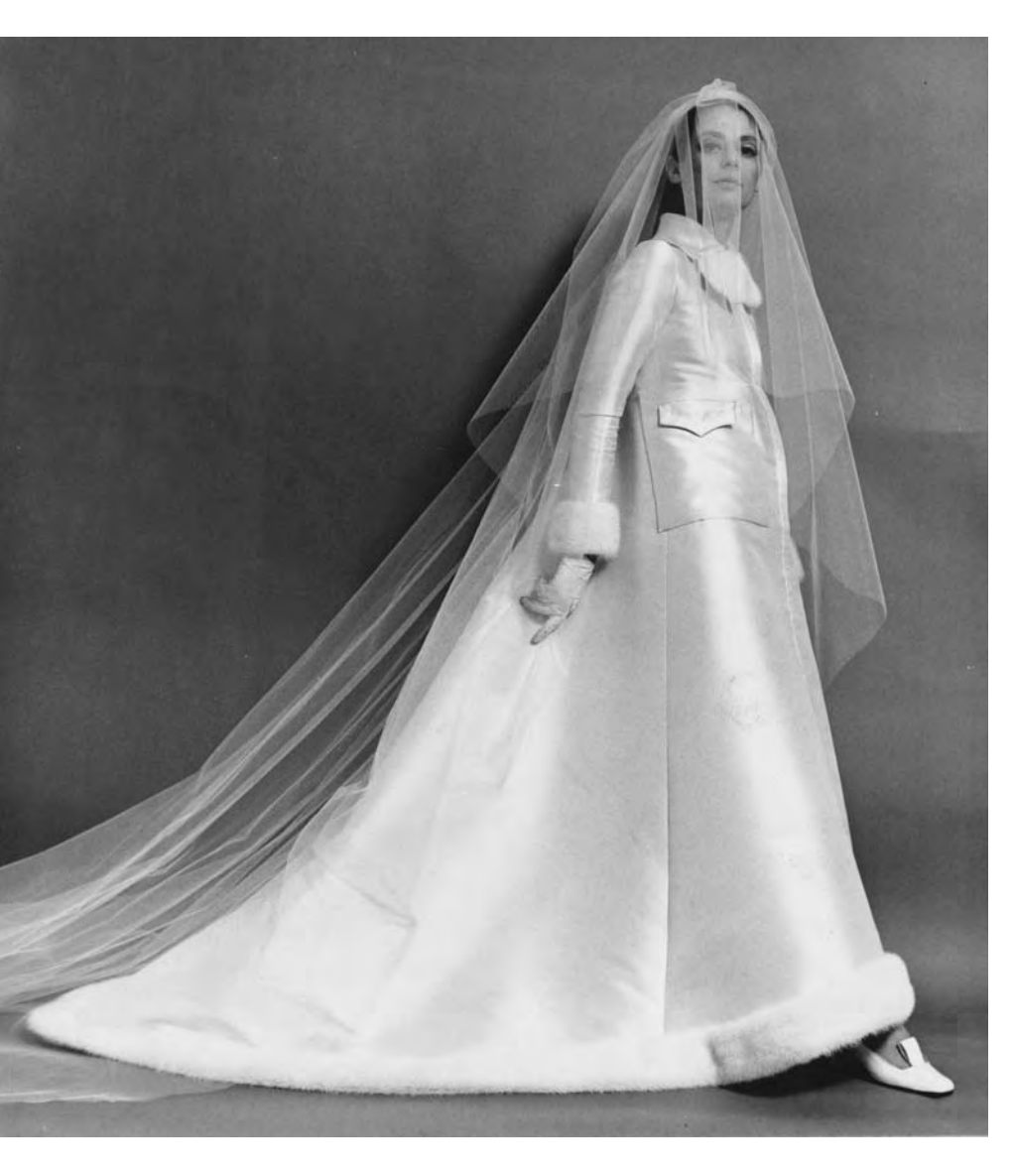
120 Ziberline wedding coat-dress by Jean Patou, with shoes by Andrea for Patou, Paris, 1967.