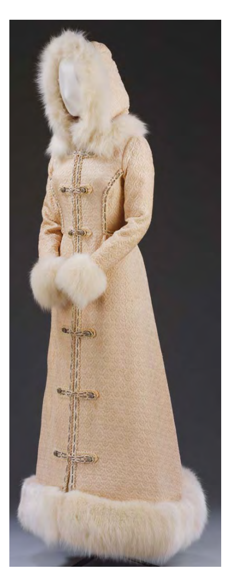
121 Silk and fox fur wedding coat by Bellville et Cie, London, 1968. The coat reflects the new fashion for maxi-coats. A furtrimmed coat worn by Julie Christie as Lara in David Lean's popular film Dr Zhivago (1965) inspired its design.